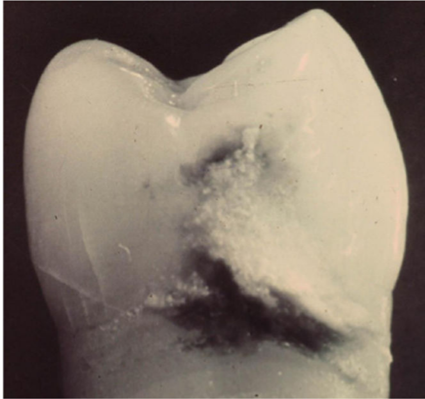
Figure 1. Dental calculus covering dental caries

Dental calculus deposition on distal surface of a maxillary premolar which extends from cemento-enamel junction to the outer surface of incipient enamel dental caries near contact area.