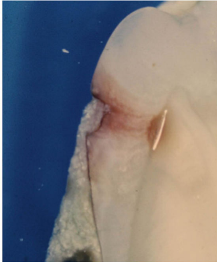
Figure 3. Dental calculus deposition into dental carious lesion

Enlarged view of distal tooth surface with dental calculus “filling” in incipient enamel dental carious lesion (white line at junction of enamel and dentin is processing artifact).