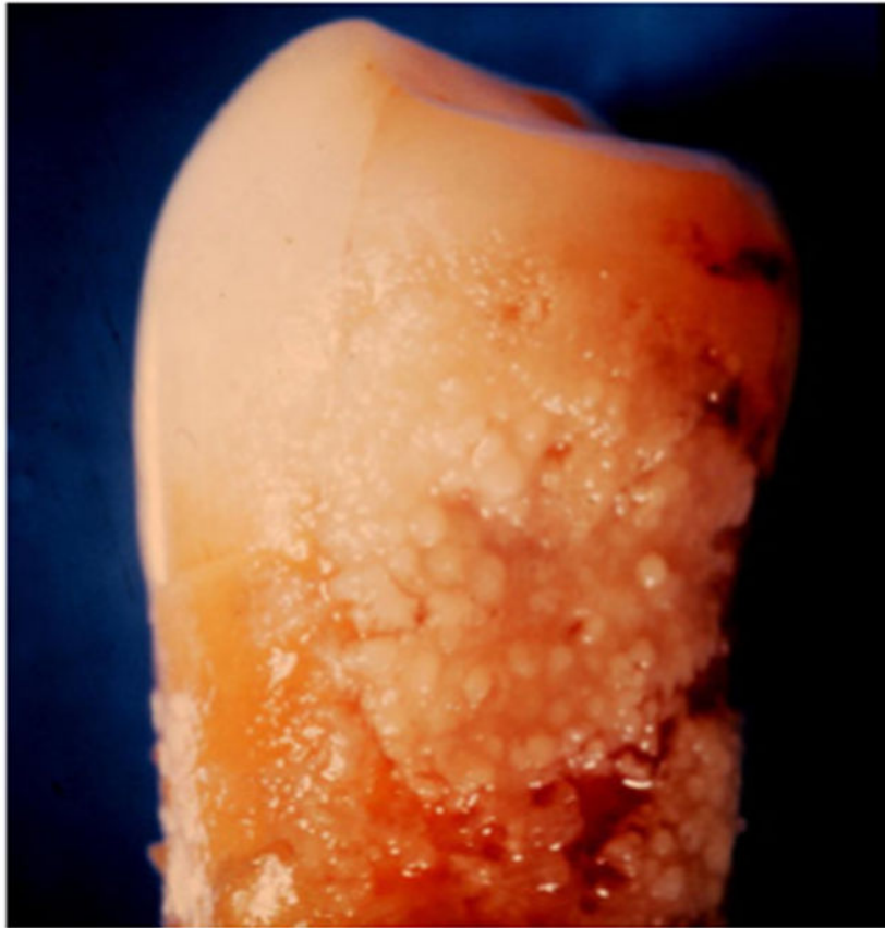
Figure 4. Dental plaque microbial biofilm

Example of thick and highly adherent dental plaque biofilm established on proximal surface of a premolar tooth.